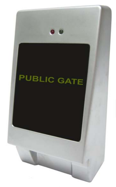
Card reader mounts on outside wall