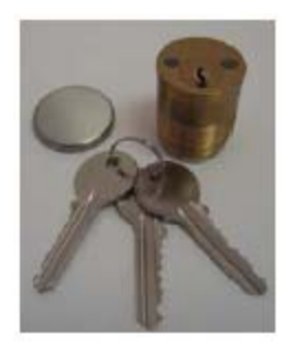
CYLINDER AND KEY SET