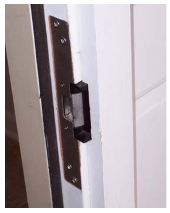
Electric strike mounts on door frame.